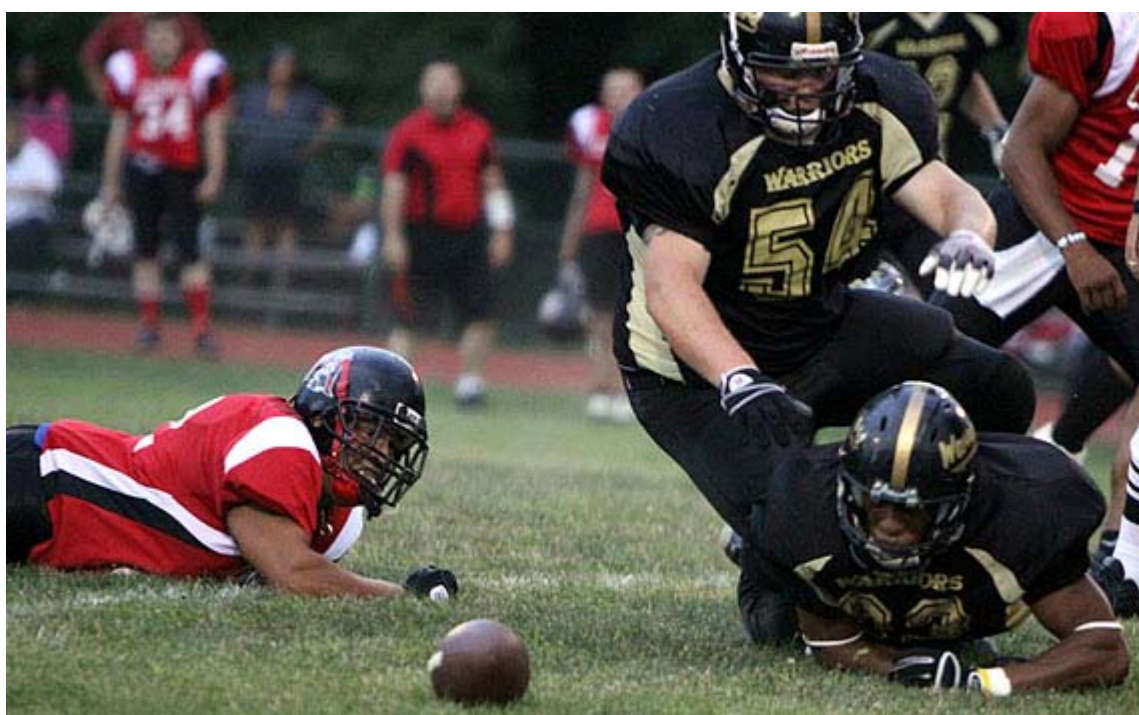
...and watches as it bounces free. A Glove Cities player recovered the ball.